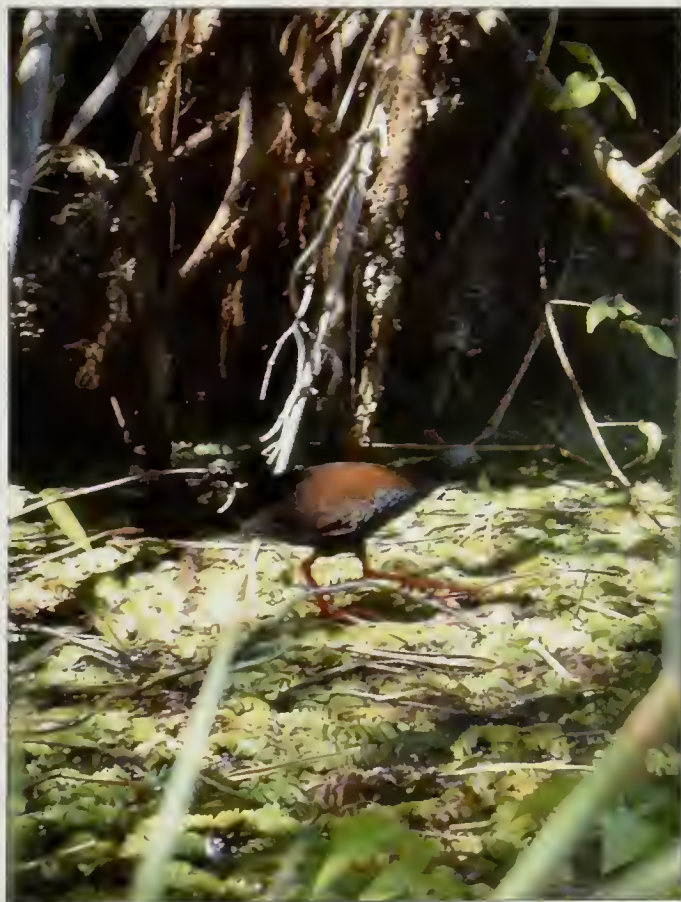
Figure 3. Adult Sakalava Rail / Râle d'Olivier adulte Amaurornis olivieri , Lac Ampandra, Madagascar, November 2002